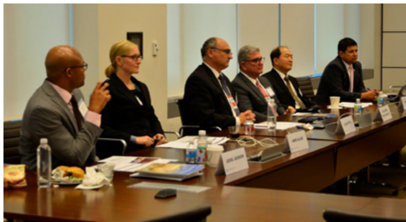
Executives of MDI banks and large banks discuss collaboration opportunities at a roundtable in Washington, D.C.

MDIs play, and have played for many years, a critical role in their local communities. Typically, MDIs serve economically challenged communities traditionally underserved by the banking industry and other businesses. The OCC understands that MDIs are uniquely positioned to create positive change in these communities and supports the MDI mission through many actions.