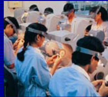
Labor Standards/ Human Rights