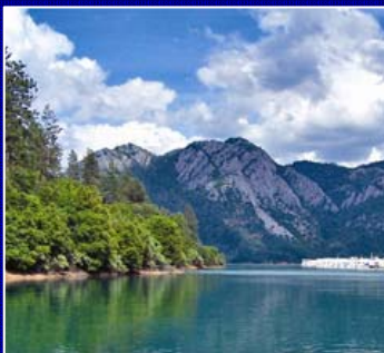
Protection of Water Resources